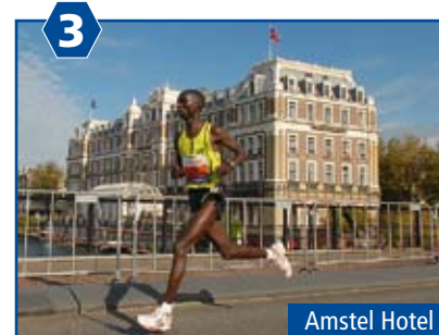
3 Amstel Hotel